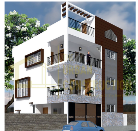
Radhakrishnan Residency Location: MIST Layout, Bangalore