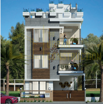
Shivan Residency Location: Odion the Woods of East, Bangalore Plot Area: 720 sq.ft Floor: G+2