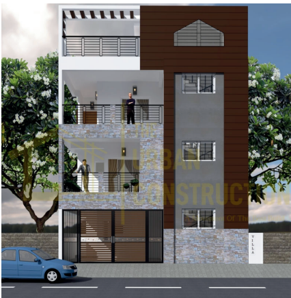
Raju Residency Location: MIST Layout, Bangalore