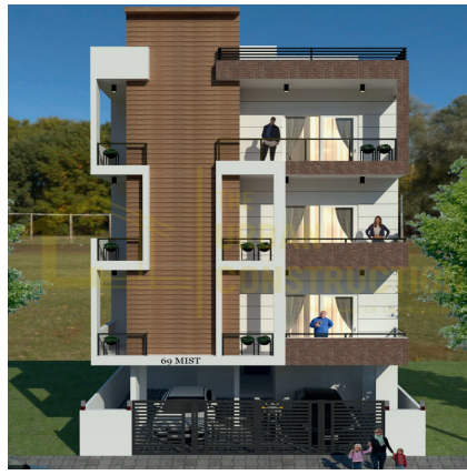
Ganesh Residency Location: MIST Layout, Bangalore Plot Area: 1350 sq.ft