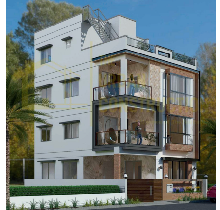
Bhagwan Das Residency Location: Odion the Woods of East, Bangalore Plot Area: 1200 sq.ft Floor: G+2