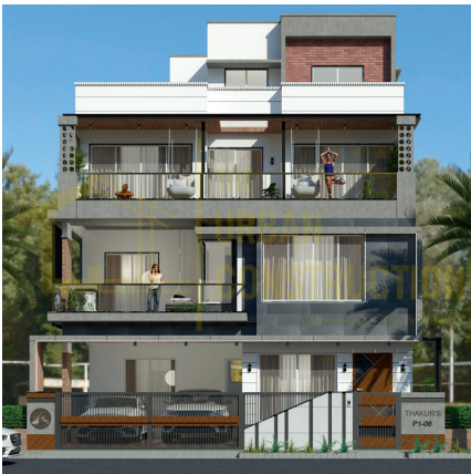
Nikitha Shivan Residency Location: Off Sarjapur Road Plot Area: 3575 sq.ft Floor: G+5