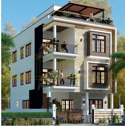
Mandira Residency Location: Odion the Woods of East, Bangalore Plot Area: 1500 sq.ft Floor: G+2