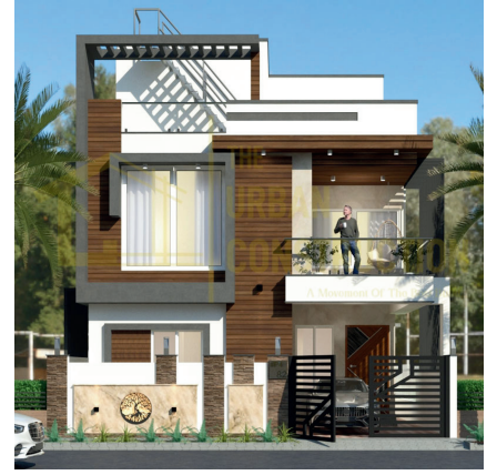
Radhakrishnan Residency Location: MIST Layout, Bangalore