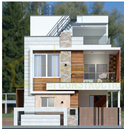
Sai LA Homes Residency